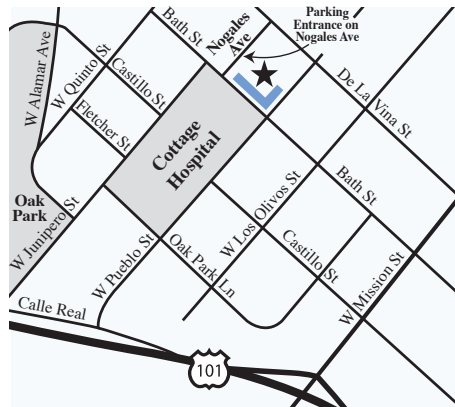
Parking available at Nogales Avenue entrance.

MRI Center 2320 Bath St., Suite 113 A Santa Barbara, CA 93105 office/schedule: 682.7744 fax: 682.3321 computer fax: 682.9202